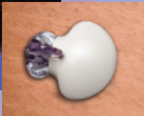
The iPro wireless recorder