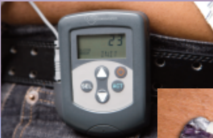
The pager-size monitor can clip to a belt or rest in a pocket.

When a patient calls, a live person answers the phone, day or night , ready to answer any questions they may have.